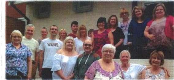
A group of our clients and volunteers outside the Centre

Drop-in Centre Just turn up for a chat with our friendly team